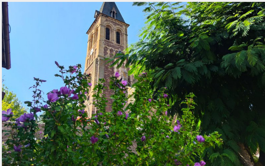
Saint Izaire