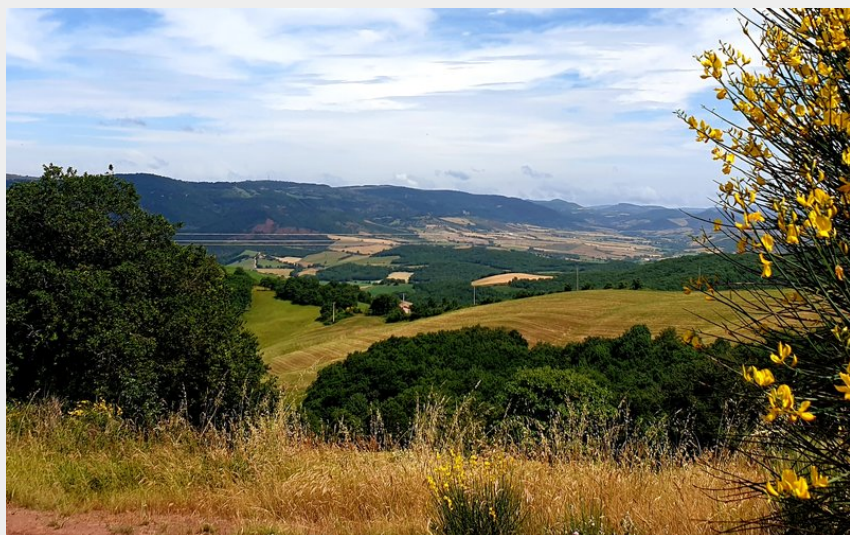
Vue vers la vallée du Dourdou