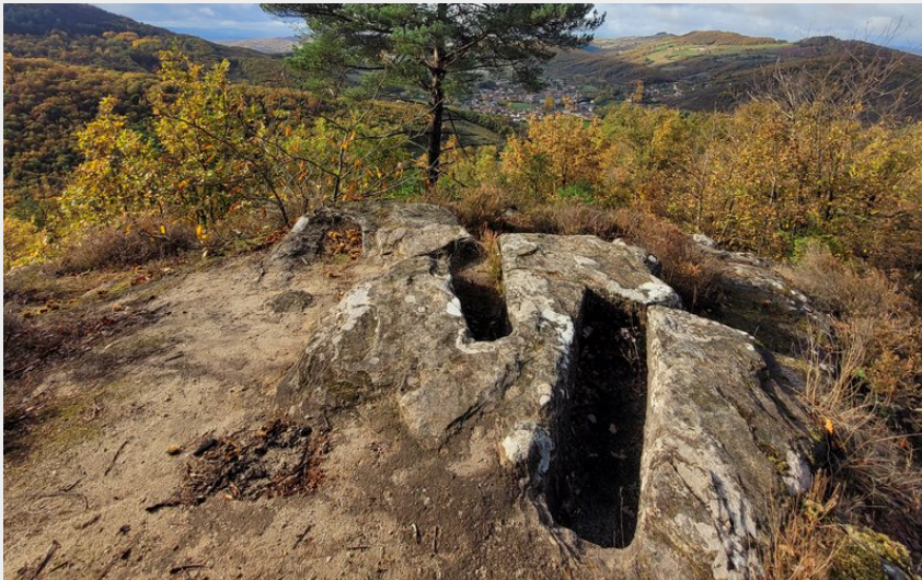
Le Joncas (Roquefort Tourisme)