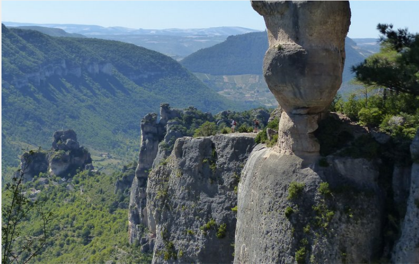
Gorges de la Jonte