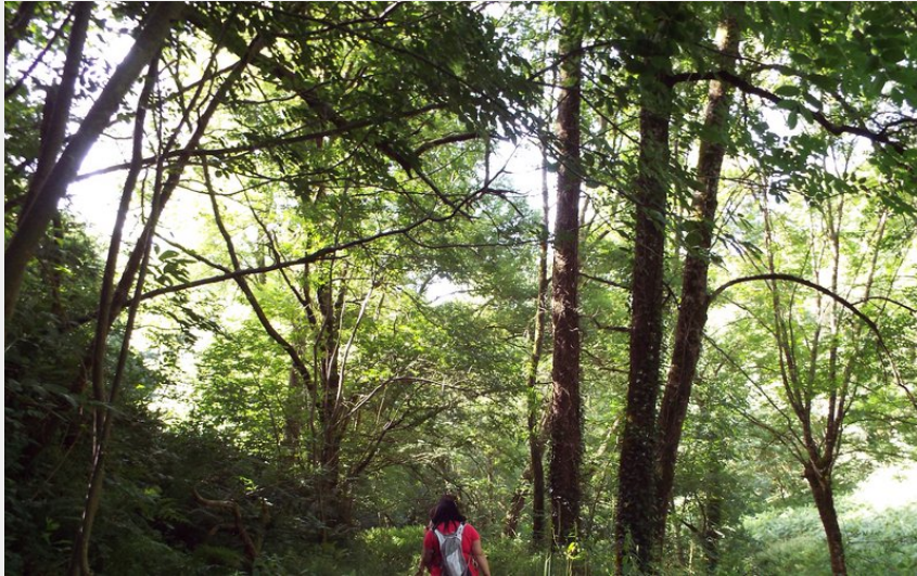
Notre Dame de Massillergues