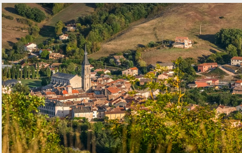
Vabres l'Abbaye (Virginie Govignon)

Des falaises de Roquefort au Rougier - Vabres-l'Abbaye