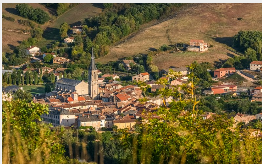
Vabres l'Abbaye (Virginie Govignon)

Des falaises de Roquefort au Rougier - Vabres-l'Abbaye