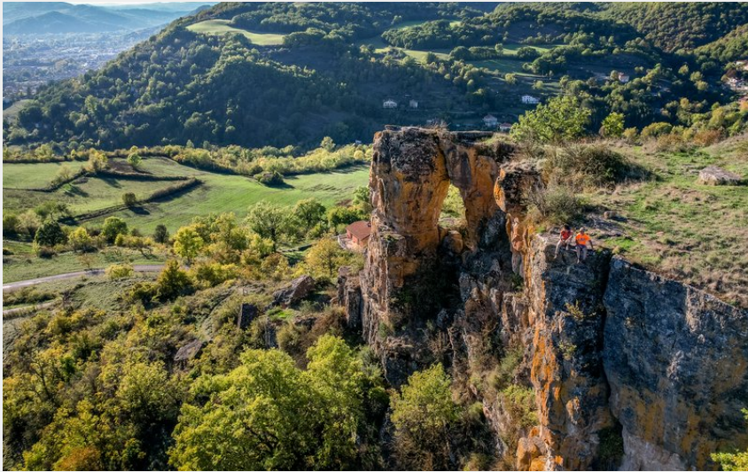
Rocher de Caylus (Virginie Govignon)