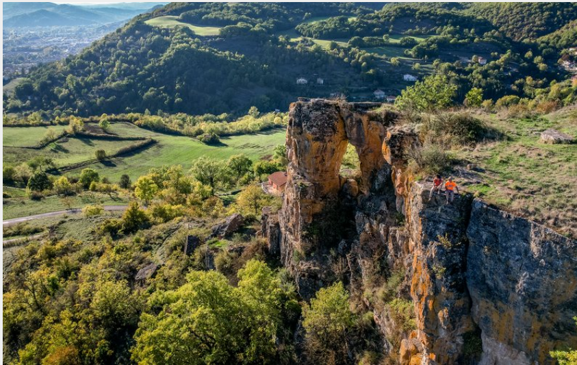
Rocher de Caylus (Virginie Govignon)