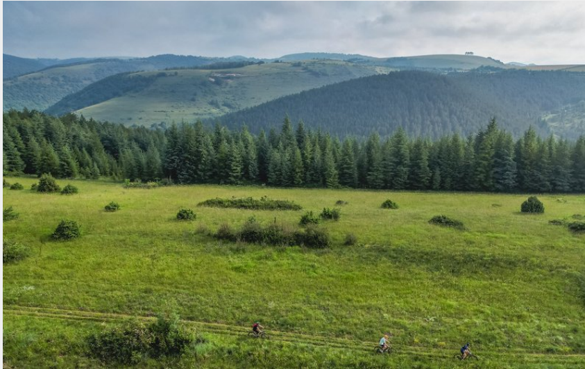
VTT (Roquefort Tourisme)