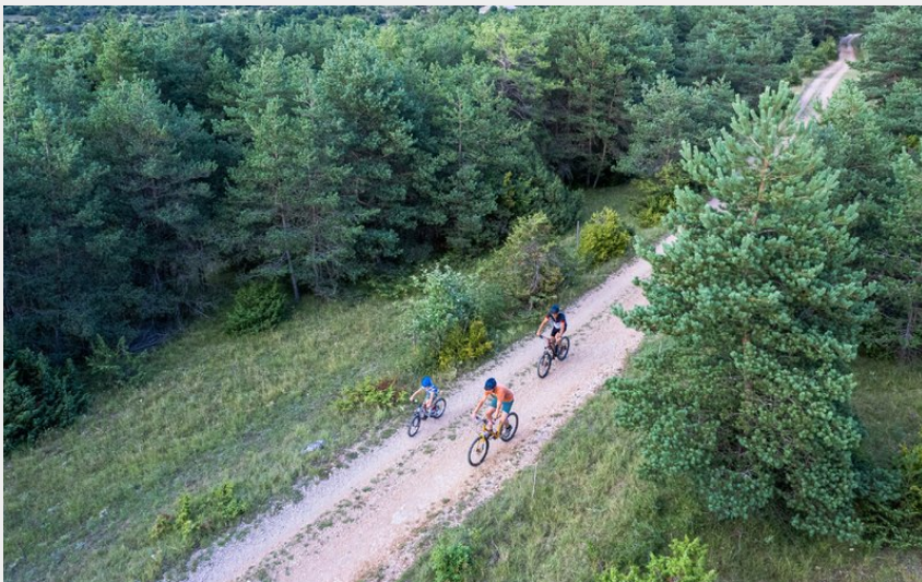
Sur le plateau du Larzac