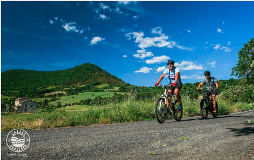
Vers la Source...