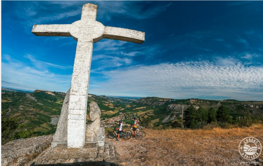
Le panorama depuis la croix de Gréponac