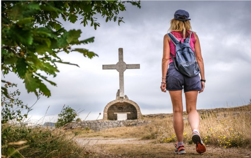
La croix de Gréponac