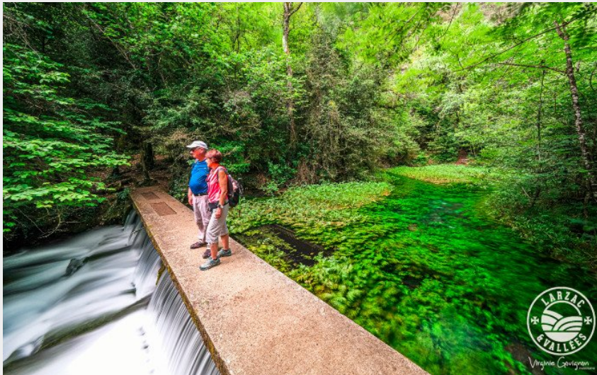
La Source du Durzon