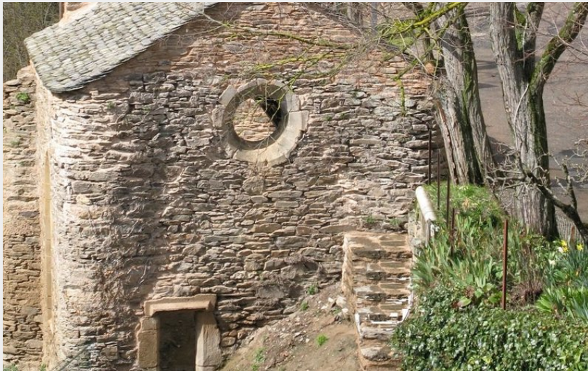
Chapelle de la Bastide (LuciePinot)