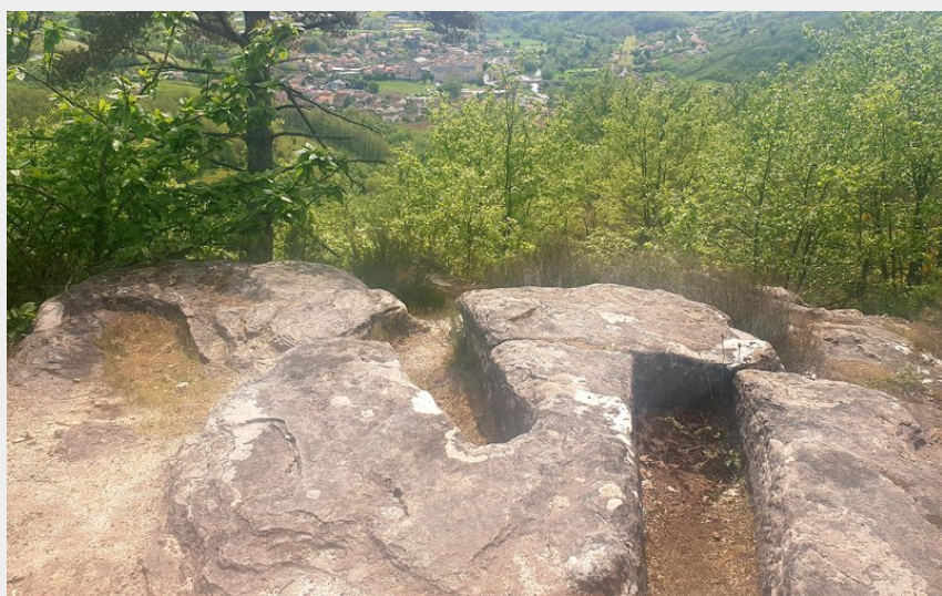
Tombes rupestres du Vieuzet (Roquefort Tourisme)

Des falaises de Roquefort au Rougier - Vabres-l'Abbaye