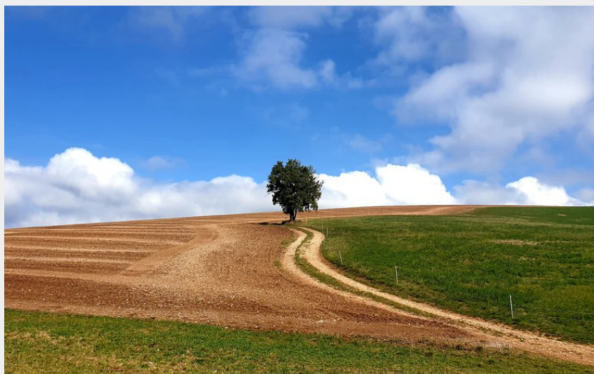
De St Félix à la Loubière (Roquefort Tourisme)