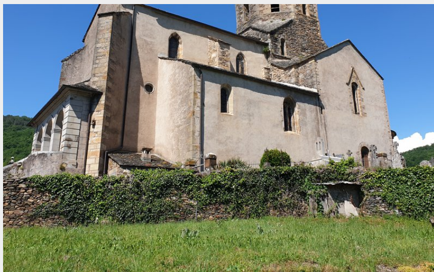
Plaisance (Roquefort Tourisme)