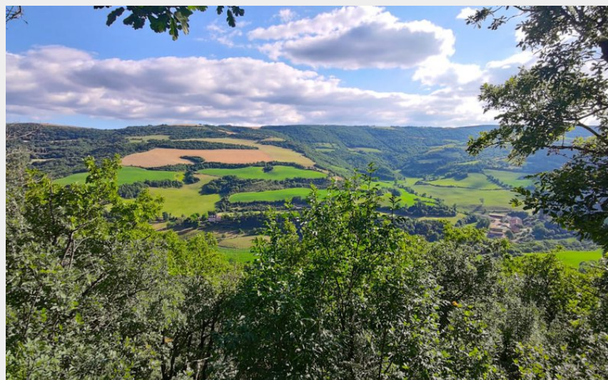
Notre Dame du Cayla