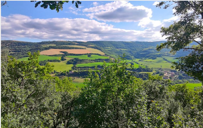
Notre Dame du Cayla