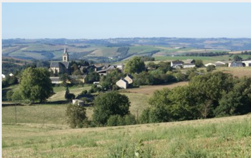
Village de Brasc (Mairie de Brasc)