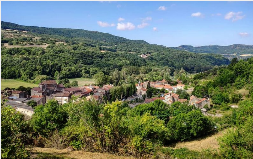
Village de Versols (Delphine Atche)

Des falaises de Roquefort au Rougier - Versols-et-Lapeyre