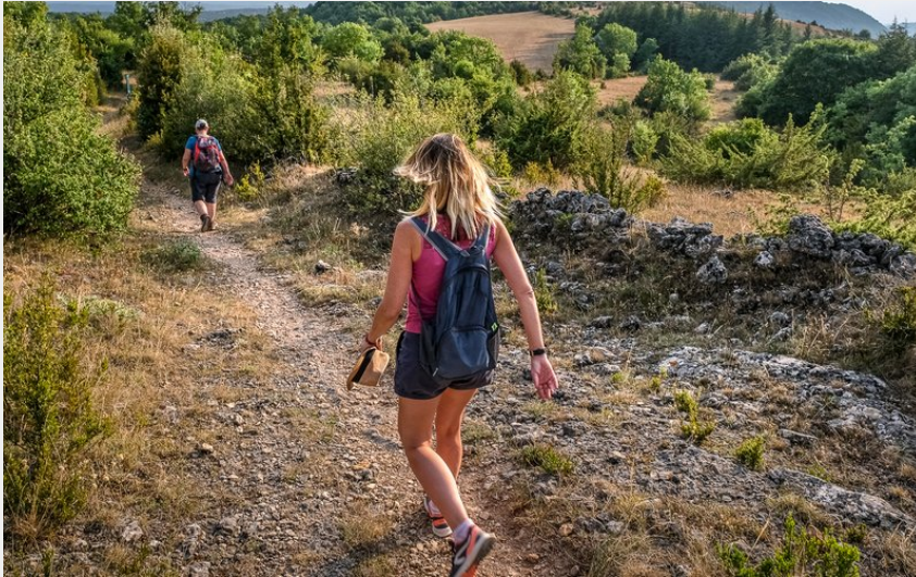
Sur le plateau du Guilhaumard