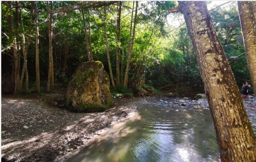
Sentier du Menhir