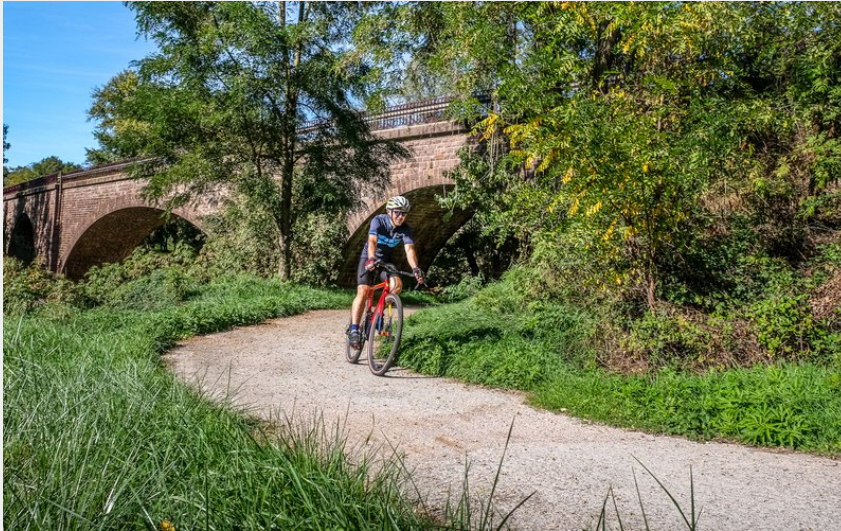
Berges de la Sorgues (Virginie Govignon)