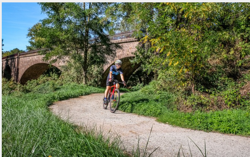
Berges de la Sorgues (Virginie Govignon)