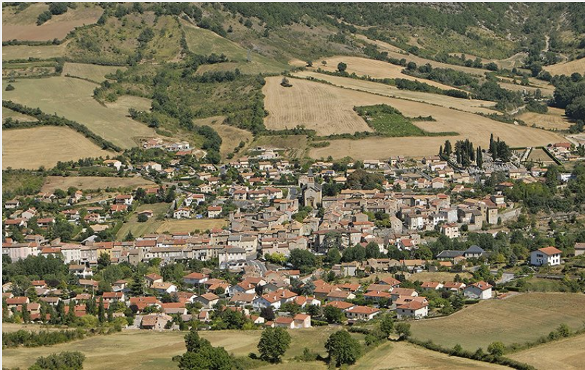
vue générale du village de Saint-Georges de Luzençon (Eric Teissèdre)