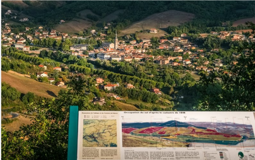
Panorama depuis Peyralbe (Virginie Govignon)