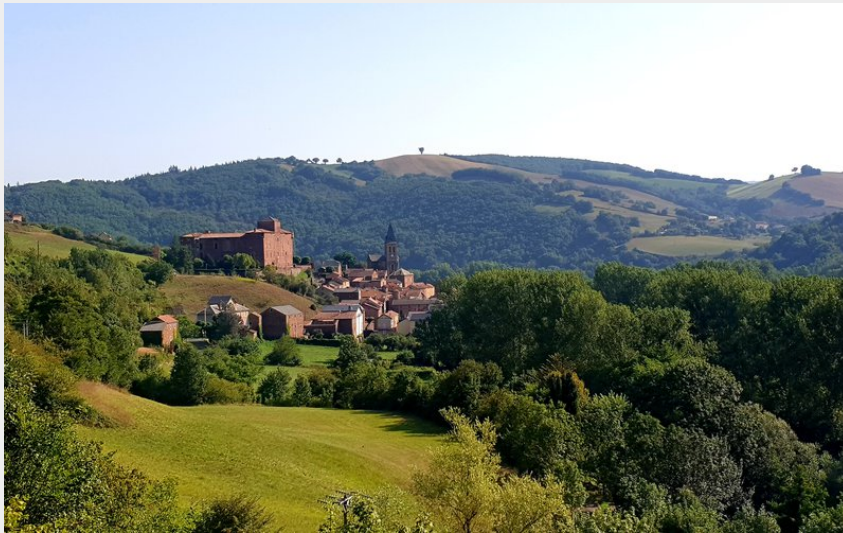
Village de Saint-Izaire