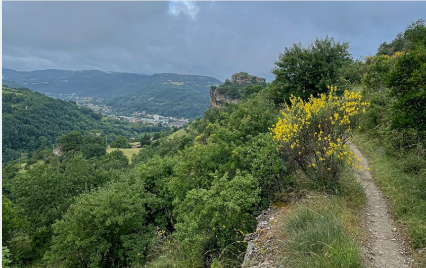
Vue sur le rocher de Caylus