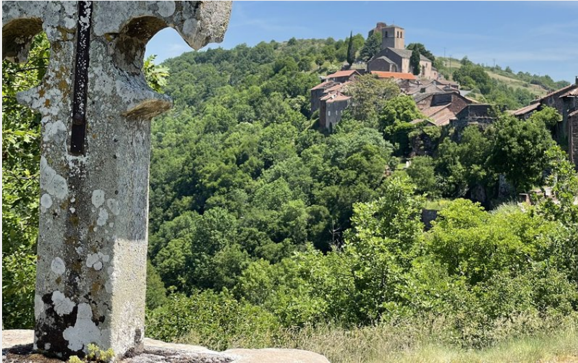
Combret sur Rance