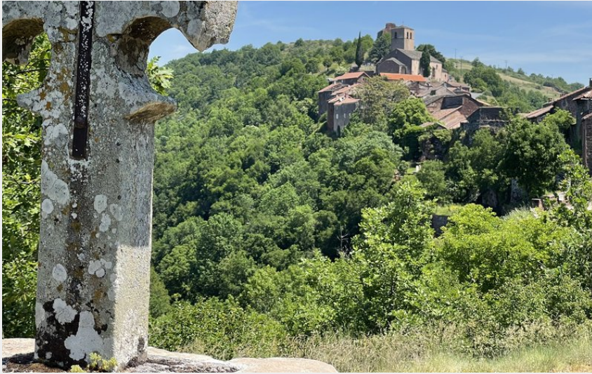
Combret sur Rance