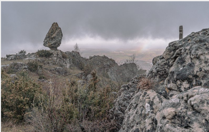
Chaos Rocheux de Roucangel (Théo Bertrand)