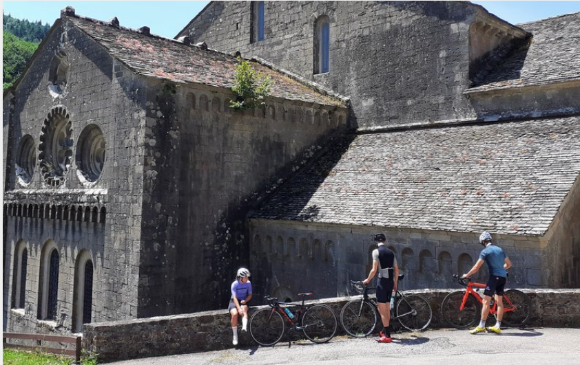
Abbaye de Sylvanès (Roquefort Tourisme)