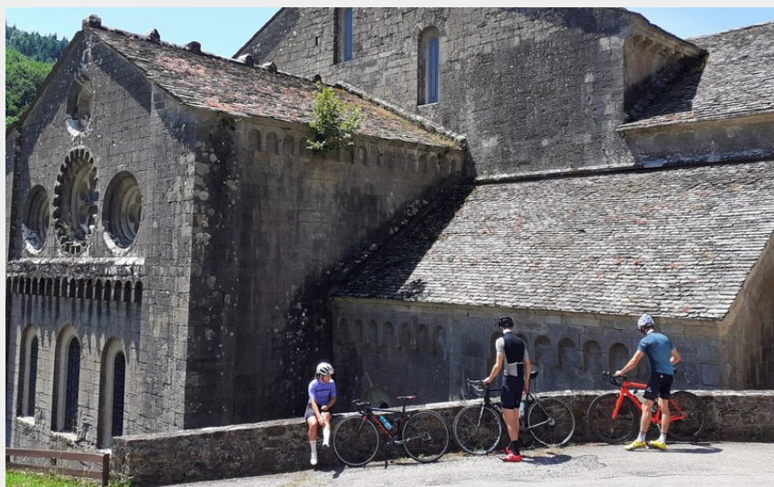
Abbaye de Sylvanès (Roquefort Tourisme)