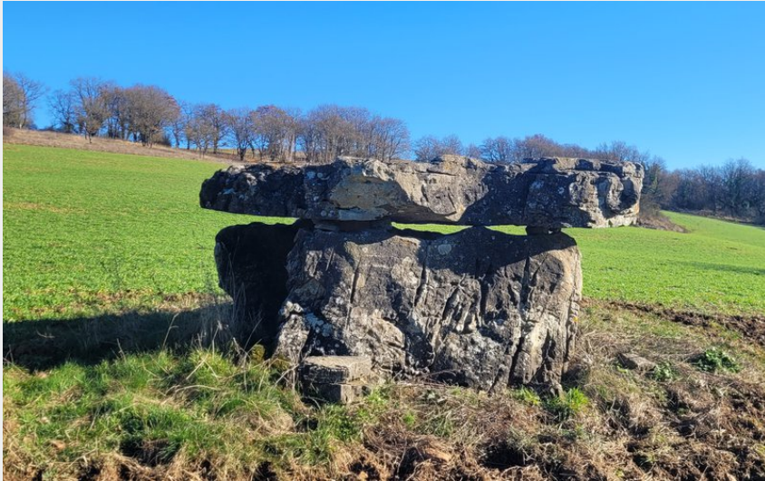
Pays de Roquefort