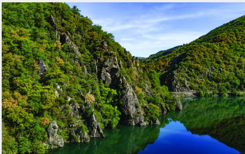
Raspes du Tarn