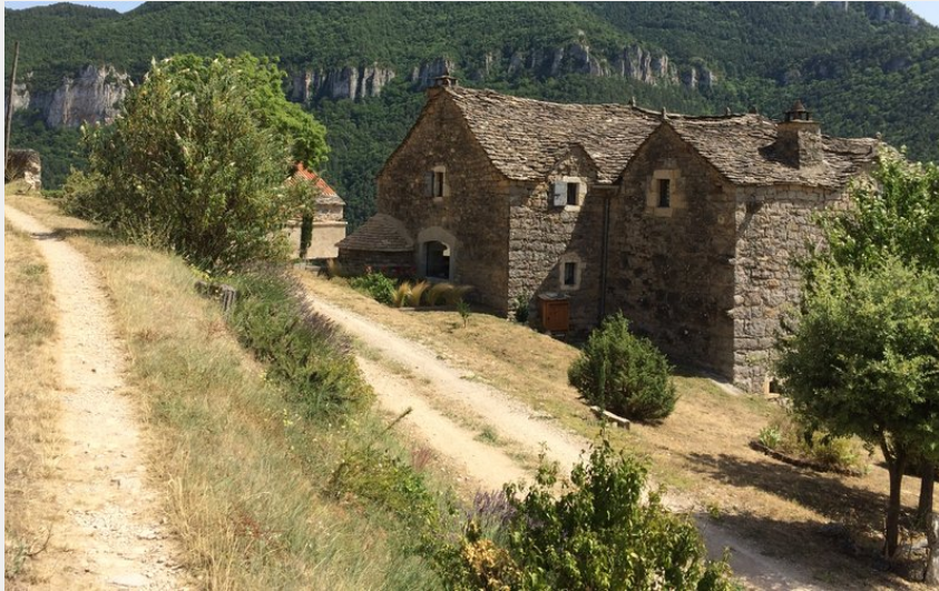
Randonnée Piédestal de fontaneilles