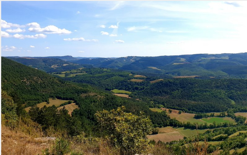
Crêtes et buissière du plateau de Mascourbe

Des falaises de Roquefort au Rougier - Saint-Félix-de-Sorgues