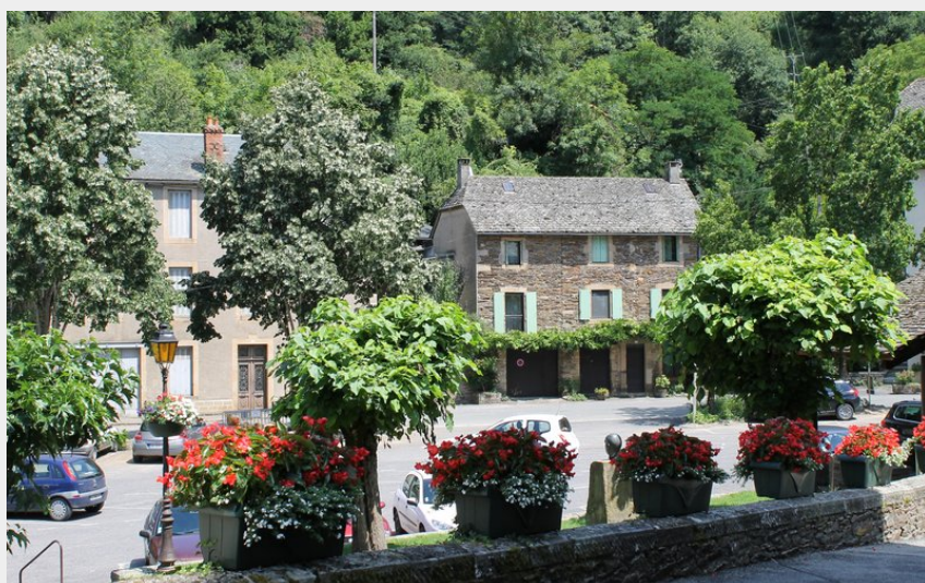
Parking de la Poste (LuciePinot)