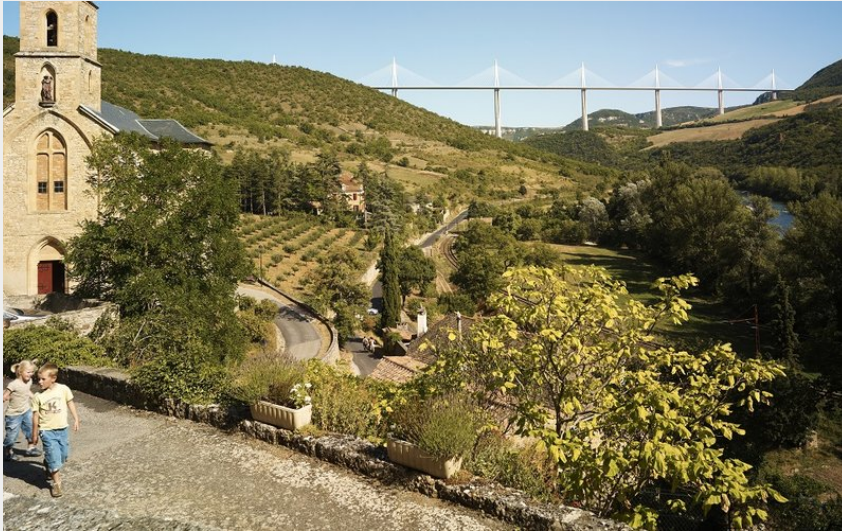
Vue depuis le Village de Peyre