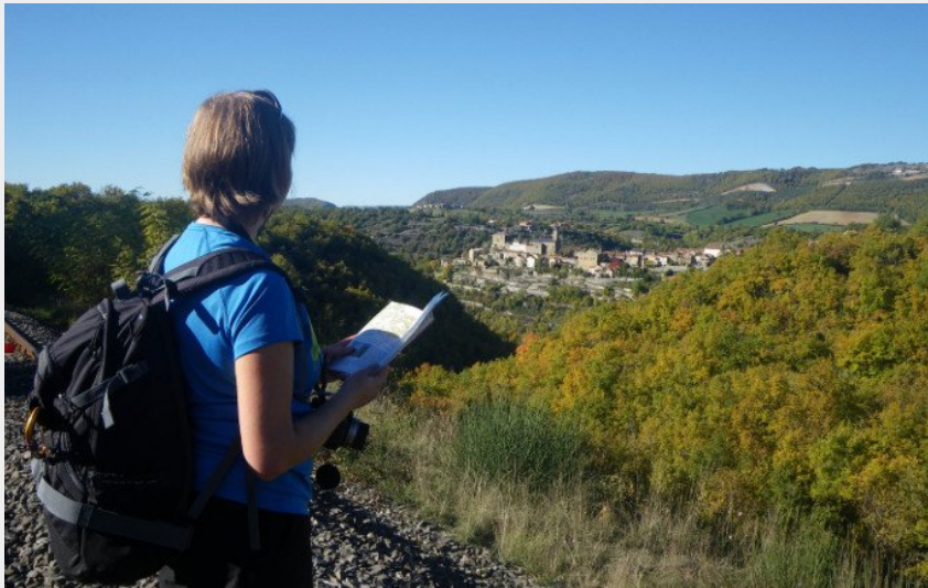
La Bastide-Pradines vue depuis la gare (Elodie Calazel)