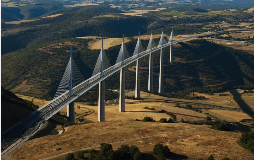
Le Viaduc de Millau