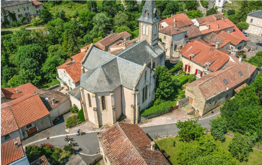
Saint-Jean d'Alcapiès (Roquefort Tourisme)