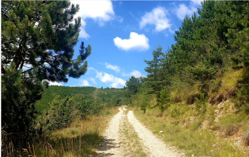
Piste forestière montée au plateau de Mascourbe (Roquefort Tourisme)