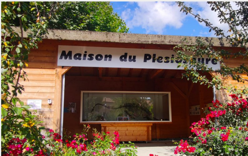
Cirque de Tournemire (Roquefort Tourisme)