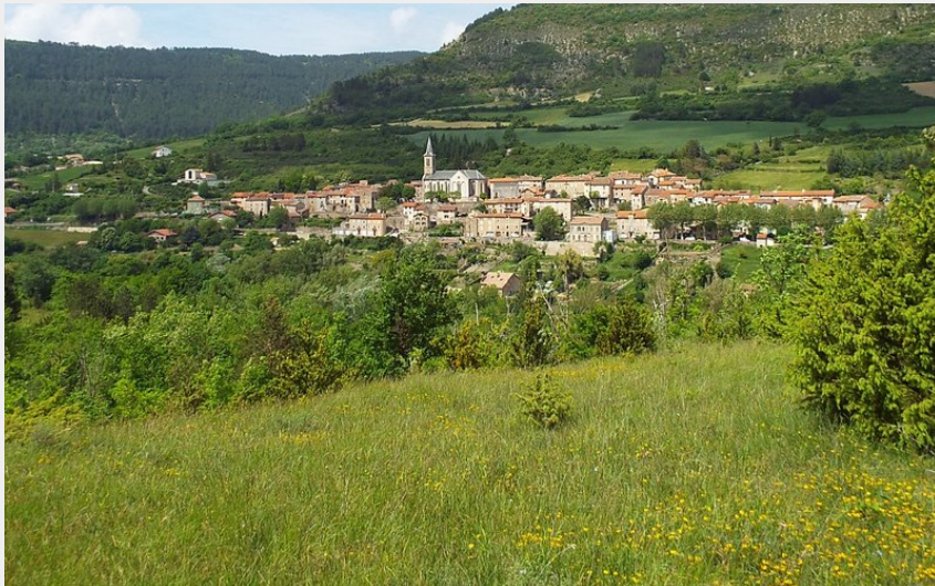
Saint-Félix de Sorgues (Delphine Atché)