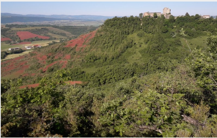
Rougiers & arrivée au chateau de Montaigut (Francis Puech)

Des falaises de Roquefort au Rougier - Sylvanès