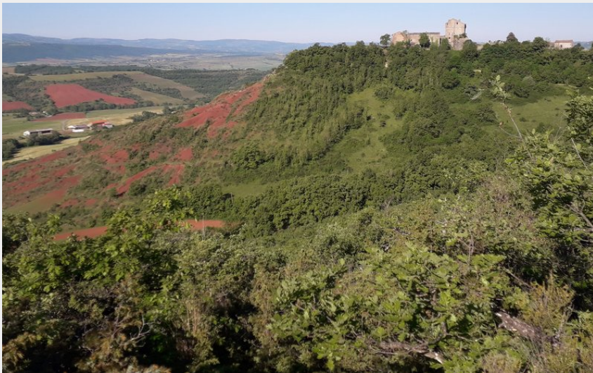
Rougiers & arrivée au château de Montaigut (Francis Puech)

Des falaises de Roquefort au Rougier - Sylvanès