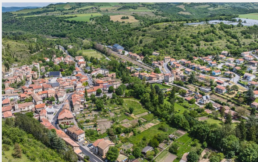
Au loin la Butte de Sargel (Virginie Govignon)