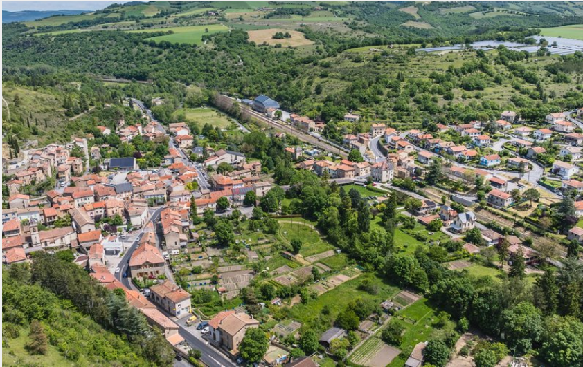
Au loin la Butte de Sargel (Virginie Govignon)